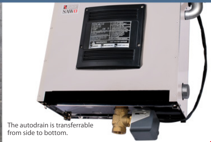
The autodrain is transferrable from side to bottom.